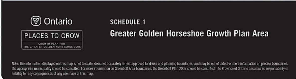
Map courtesy of the Ontario Growth Secretariat.